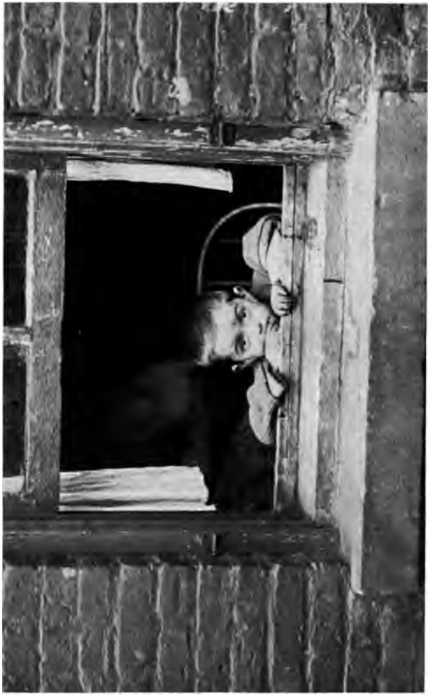
WHAT WILL YOU DO WITH ME?

1 2 3 4 5 6 7 8 9 10 11 12 13 14 15 16 17 18 19 20 21 22 23 24 25 26 27 28 29 30 31 32 33 34 35 36 37 38 39 40 41 42 43 44 45 46 47 48 49 50 51 52 53 54 55 56 57 58 59 60 61 62 63 64 65 66 67 68 69 70 71 72 73 74 75 76 77 78 79 80 81 82 83 84 85 86 87 88 89 90 91 92 93 94 95 96 97 98 99 100